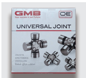
Pattern is not normally visible

As it is a transparent coating, it is not normally visible. However, pattern will clearly appear when light hits it. It is easy to distinguish the fake product package because this pattern has not been printed.